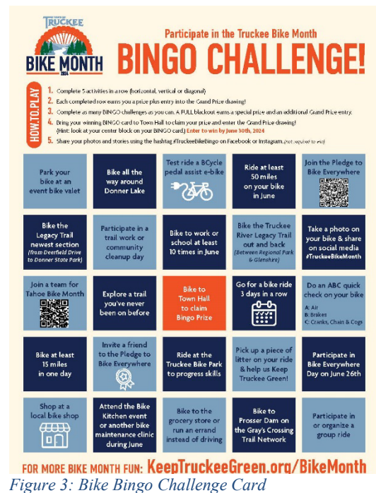
Figure 3: Bike Bingo Challenge Card