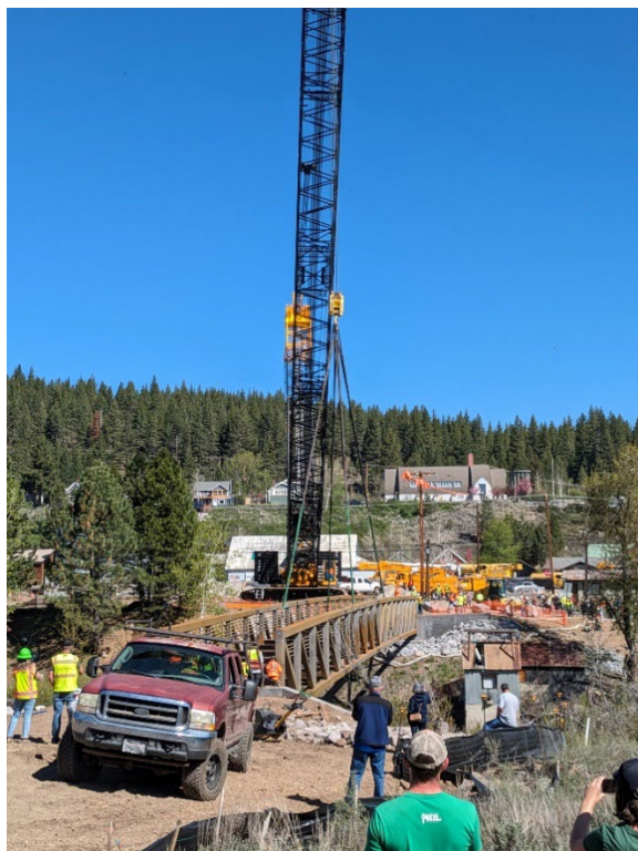
Figure 5: New Pedestrian Bridge installation for Legacy Trail

Truckee River Legacy Trail Phase 4 Scheduled to open by late July 2024