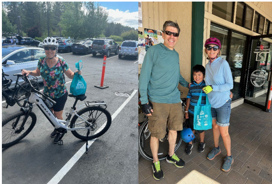
Figure 2: Participants in Bike Everywhere Day