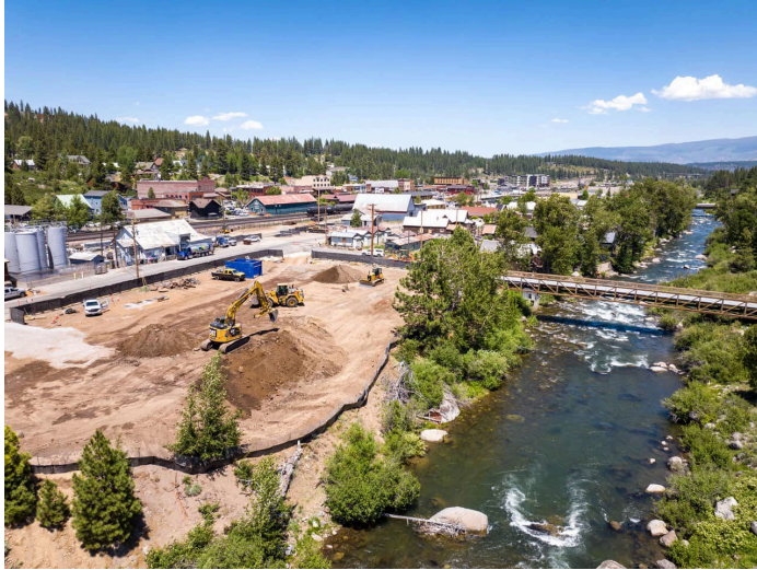
Figure 3: Beginning of Construction, June 2024

Construction has begun at DEWBHEYÚMUWE? PARK. This park on West River Street has been named DEWBHEYÚMUWE? PARK by the Washoe Tribe. The Washoe word DEWBHEYÚMUWE? translates to “the water running out” in reference to the Truckee River being the one outlet for Lake Tahoe.