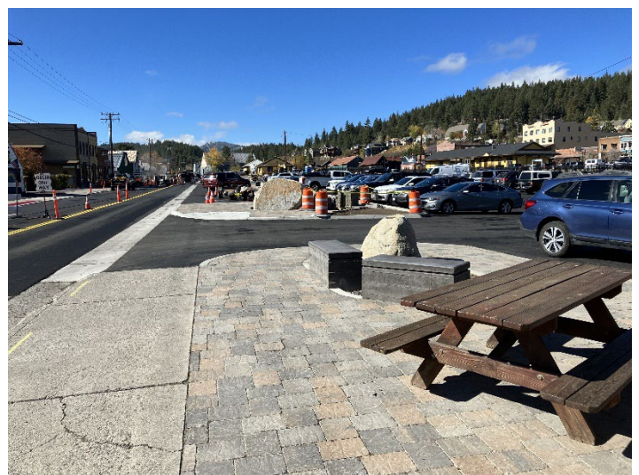
Figure 6: West River Street Fall 2023

West River Streetscape Improvements Scheduled to be complete by October 2024