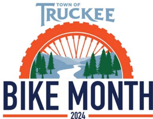
Figure 2: Truckee Bike Month Logo

In years past, the Town has been minimally involved with "Tahoe Bike Month", which is co-hosted by the Tahoe Regional Planning Agency and the Lake Tahoe Bicycle Coalition. This year, in order to build up participation in Truckee, our staff created a Truckee Bike Month, including the creation of a logo, a month-long bingo challenge, and a Bike Everywhere Day Pledge and event. Local businesses were involved, donating raffle prizes, discount cards, and other swag for the events throughout the month. Though participation was still relatively low, the participants we interacted with were all very excited to have a Truckee Bike Month with events close to home and are looking forward to seeing the program grow in future years.