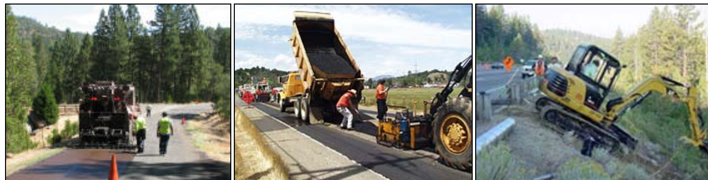
Estimated total of ARRA funds is $3.7 million for Nevada County jurisdictions to use on roadway projects such as asphalt overlays.

In addition to the Federal Surface Transportation Program funding, ABX 3-20 sets aside 3% of the ARRA funding (approximately $77 million statewide) for projects eligible for funding under the Transportation Enhancement (TE) program. State priorities for TE projects include projects employing community or state conservation corps, bicycle and pedestrian activities, and other TE eligible projects such as acquisition of scenic easements and scenic or historic sites, scenic or historic highway programs, landscaping and scenic beautification, and historic preservation and rehabilitation. From the $77 million, $130,909 is available for projects in Nevada County.