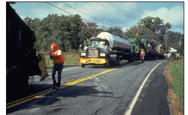
Deteriorated roadways will be target projects for ARRA funds