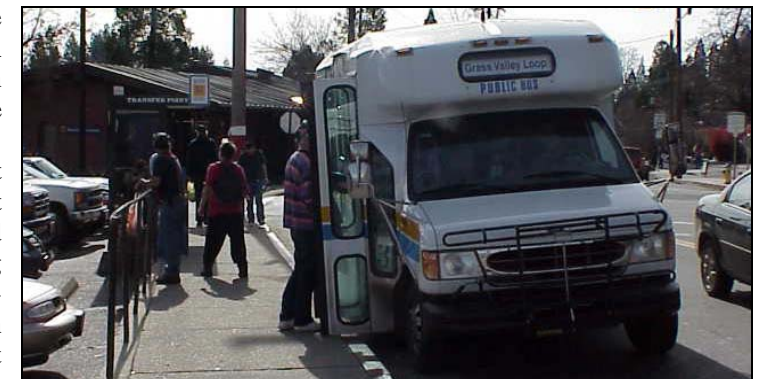
Gold Country Stage bus picking up passengers downtown G.V.

The consultant is currently developing a working paper that analyzes the mobility management options and input received at the Community Mobility Summit. It is anticipated that a second public workshop will be held in late April to review this working paper with the stakeholders. The consultant will then incorporate the information from the working paper into the service plan sustainability alternatives in the Draft WNCTDP. The draft report will then be reviewed by NCTC and the public. NCTC