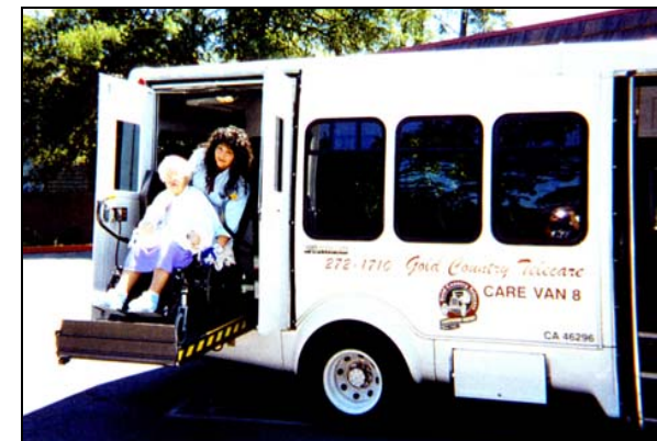
Telecare van transporting a wheelchair passenger