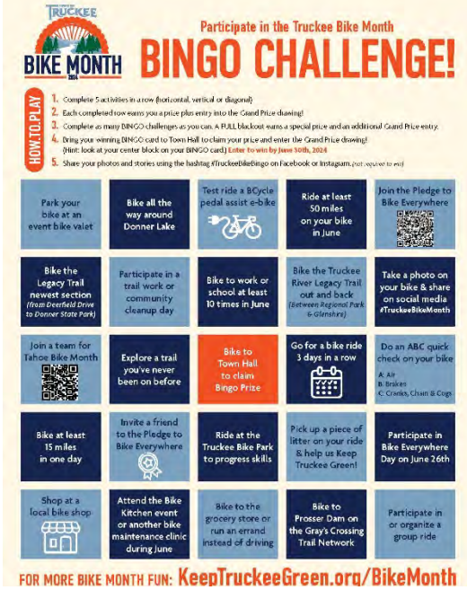
Figure 3: Bike Bingo Challenge Card