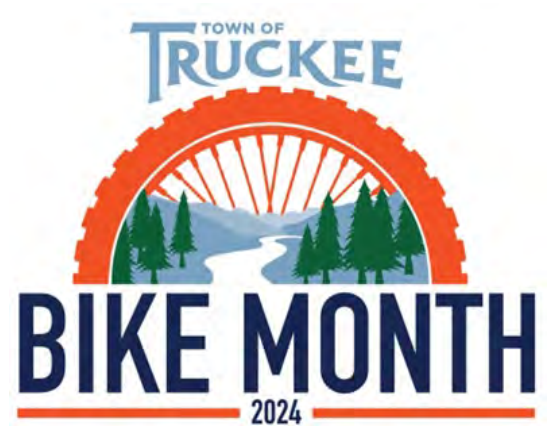
Figure 2: Truckee Bike Month Logo

In years past, the Town has been minimally involved with "Tahoe Bike Month", which is co-hosted by the Tahoe Regional Planning Agency and the Lake Tahoe Bicycle Coalition. This year, in order to build up participation in Truckee, our staff created a Truckee Bike Month, including the creation of a logo, a month-long bingo challenge, and a Bike Everywhere Day Pledge and event. Local businesses were involved, donating raffle prizes, discount cards, and other swag for the events throughout the month. Though participation was still relatively low, the participants we interacted with were all very excited to have a Truckee Bike Month with events close to home and are looking forward to seeing the program grow in future years.