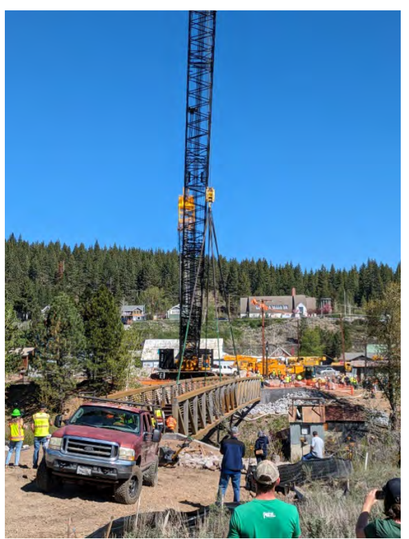
Figure 5: New Pedestrian Bridge installation for Legacy Trail

<u>Truckee River Legacy Trail Phase 4</u> Scheduled to open by late July 2024