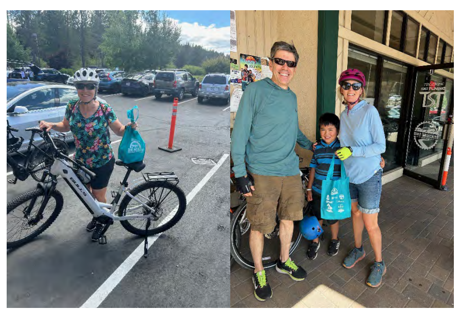
Figure 2: Participants in Bike Everywhere Day