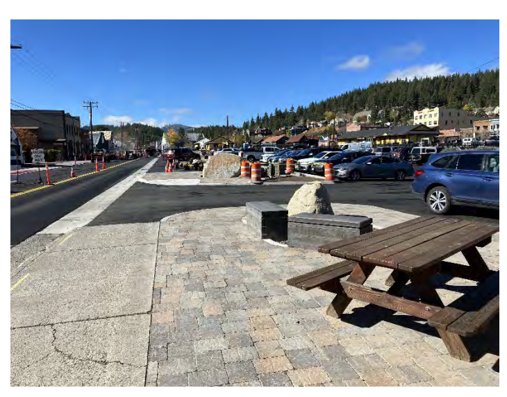
Figure 6: West River Street Fall 2023

West River Streetscape Improvements Scheduled to be complete by October 2024