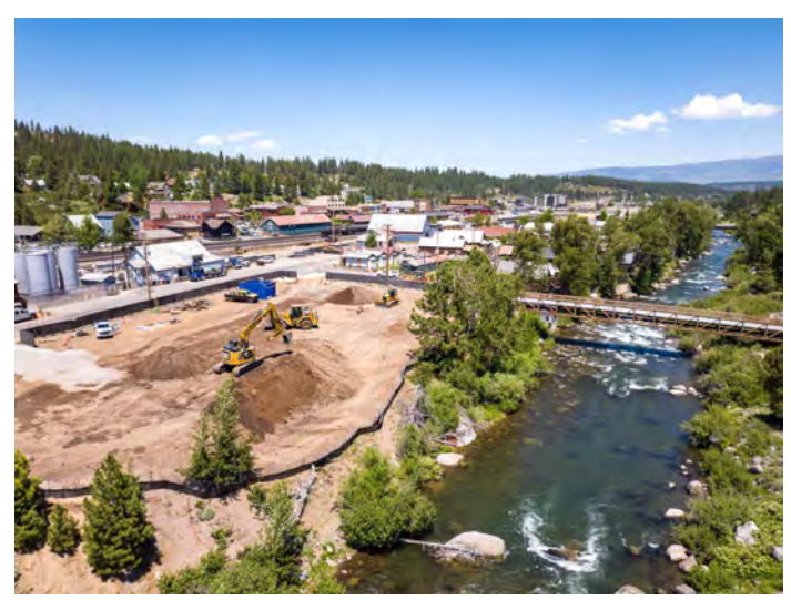
Figure 3: Beginning of Construction, June 2024

Construction has begun at DEWBEYÚMUWE? PARK. This park on West River Street has been named DEWBEYÚMUWE? PARK by the Washoe Tribe. The Washoe word DEWBEYÚMUWE? translates to "the water running out" in reference to the Truckee River being the one outlet for Lake Tahoe.